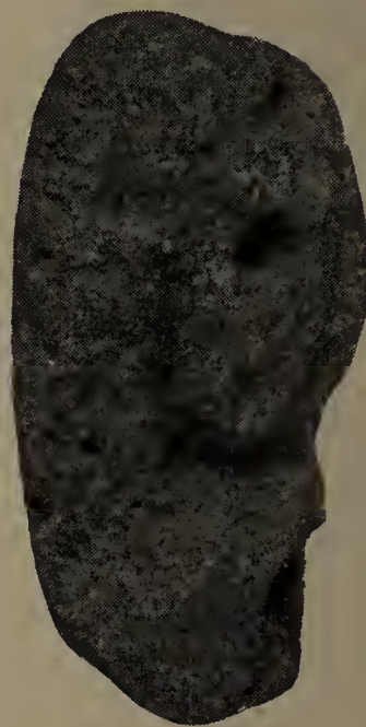
Fig. 3. Head cut from Volcanic Rock. Side view. (One-half natural size.)